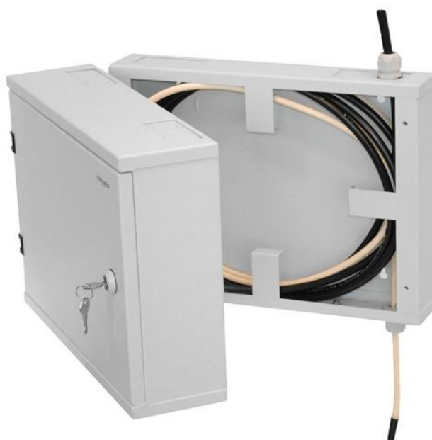
Optional cable reserve frame mounted on the rear part of the cabinet