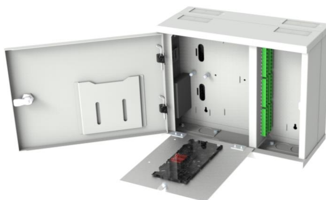
View of line cable part