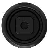
- square type