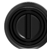
- notch type