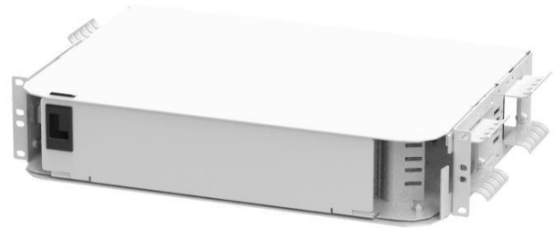
View of 2U patch panel