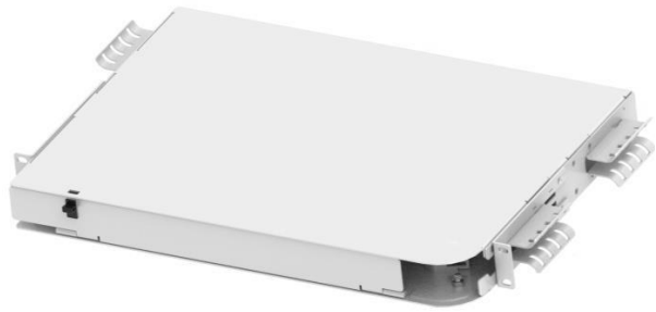
View of 1U patch panel