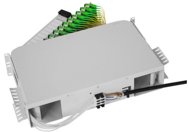
1U and 2U Patch panel with embeddable PS-TH-12-05 tube separator