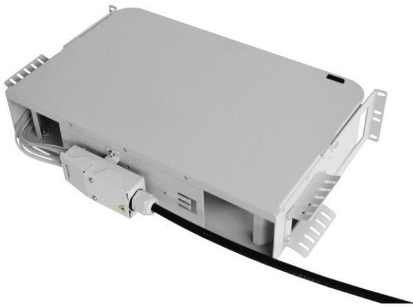
2U Patch panel with embeddable RT-01 tube separator